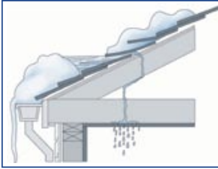
Leaks caused by ice dams